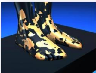
Iron and Clay mixed ... Rome and the Ottomans

The Ottoman Empire was not wiped out, but rather it surrendered after being defeated in WWI (hence the head wound). It will rise back up during the tribulation period and its wound be healed. Its goal is to rule the entire world, it will seek for new alliances to bring in the masses. In comes the Catholic Pope. The religious and spiritual man ... he will become the Anti-spirit .